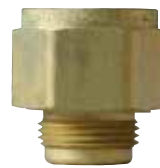
7572C-14A For Transfer Valves