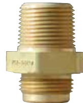
7572C-15A For Globe and Angle Valves