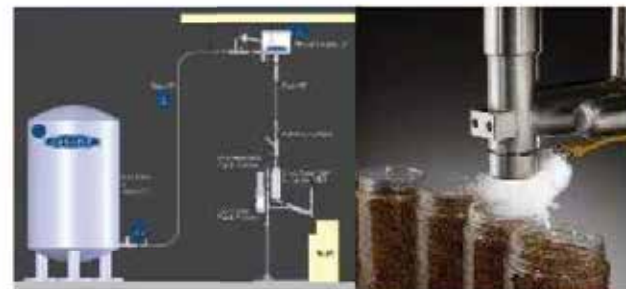
Food & Beverage Packaging