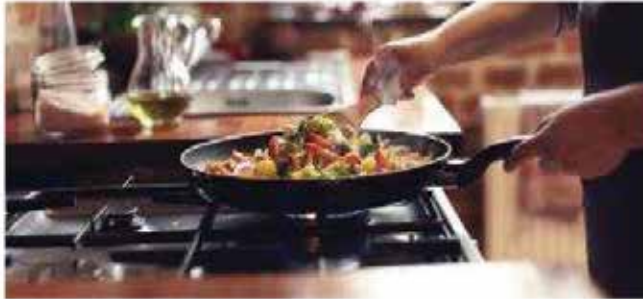
Cooking and Baking