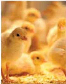
Pig and Chicken Rearing