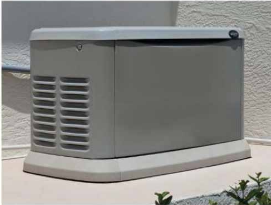
Emergency Power Generation