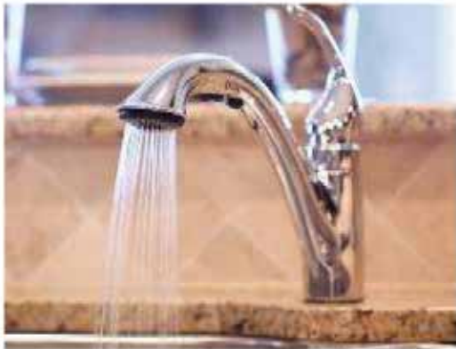
Hot Water Heating