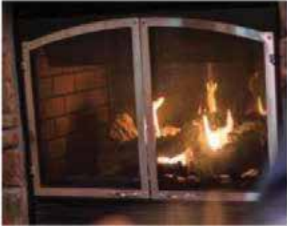
Home and Industrial Heating