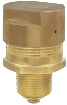
7590U with Cap