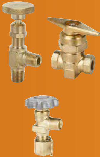
Master & Line Station Valves