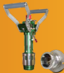
Point of Use