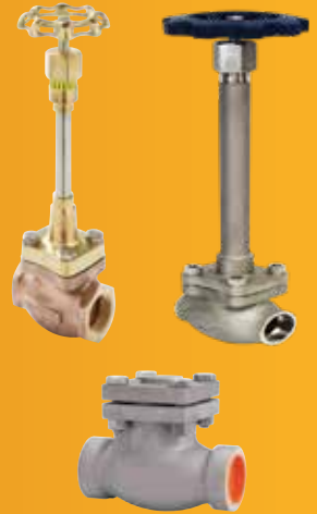
Globe, Gate & Check Valves