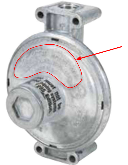
Model Number Location (Regulator Bonnet)

Which Regulators Are Affected? The affected regulator models are numbers 302, 302P, 302V, 302VP, 302V9 & 302V9LS with manufacturing date codes of 09/22 through 02/23, including regulators marked with date codes of 21/22. The model number can be found on the bonnet of the regulator (see Figure 1) and the date code is marked on the regulator body as shown in (Figure 2).